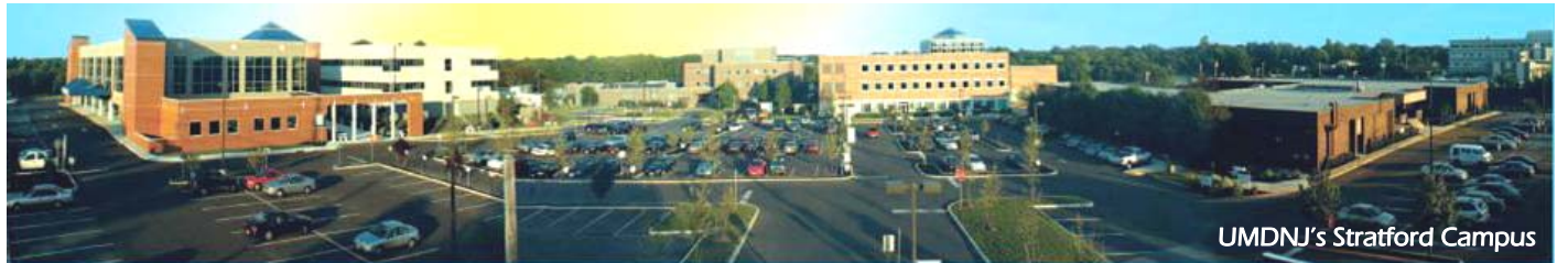
UMDNJ's Stratford Campus

683 Hoes Lane West • P.O. Box 9 • Piscataway, NJ 08854 • (732) 235-9700 • http://sph.umdj.edu