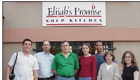
Former students, now alumni/ae, and faculty are pictured from a previous year as part of the ongoing, supportive relationship of SPH with Elijah's Promise.

Guests at Elijah's Promise are ethnically and racially a diverse group. The majority are adult males between the ages of 18 and 65 years old. About 30 percent of its guests have no permanent place to live, and of those who do, only about 60 percent have a place to cook. The Kitchen is one place