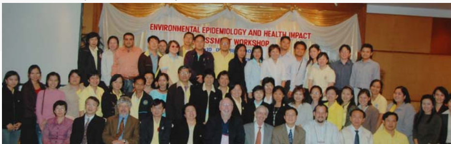
Pictured are some of the faculty and participants of the Environmental Epidemiology and Health Impact Assessment Workshop, the first of four Thai Fogarty Workshops to be held this academic year, held in early October in Bangkok, Thailand.